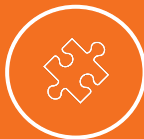
GOVERNANCE & STRATEGIC RISK MANAGEMENT