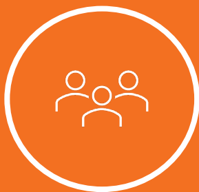
PEOPLE & SAFETY