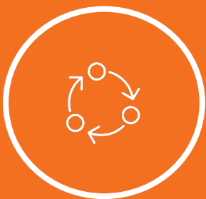
LEADERSHIP & CULTURE