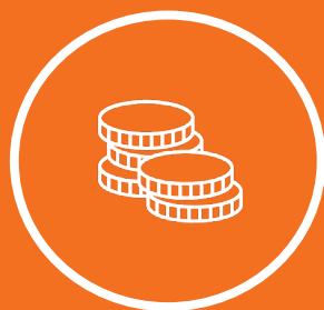
FINANCE & BUSINESS MANAGEMENT