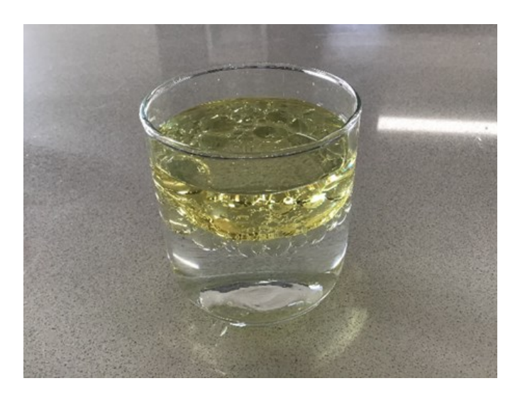
STEP 2: Pour vegetable oil into your cup to create a 2cm layer on top of the water.