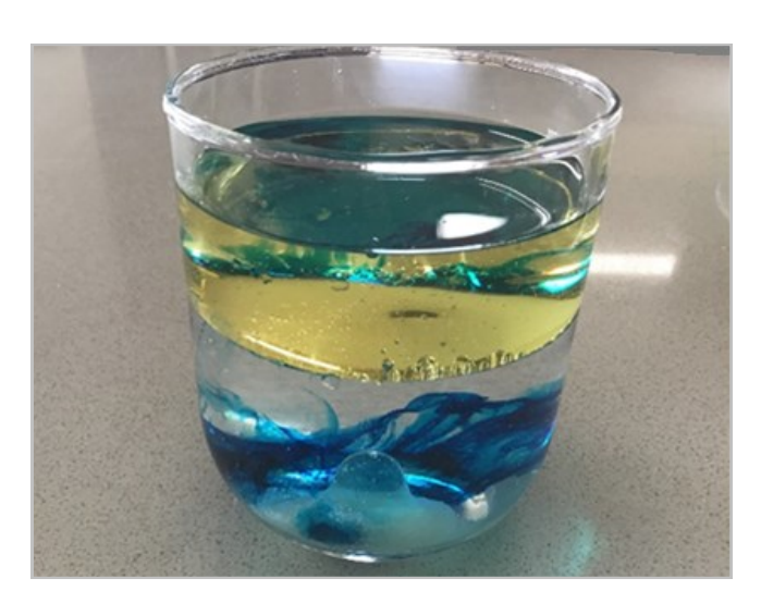
STEP 4: Sprinkle salt into your cup and watch what happens.