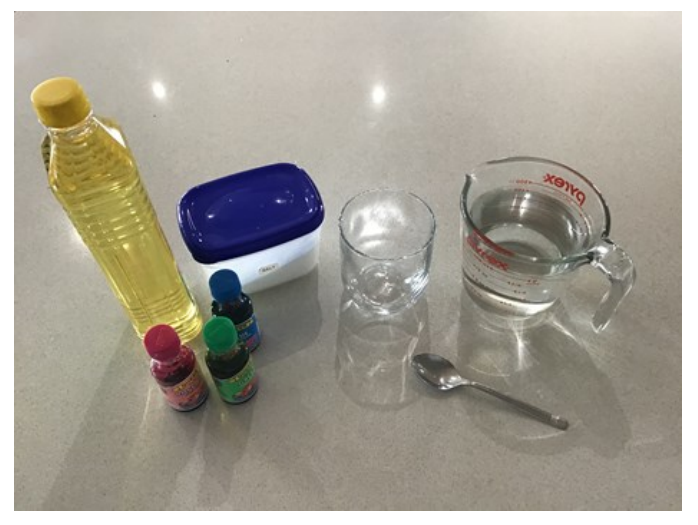
WHAT YOU NEED: Clear drinking glass, water, vegetable oil, liquid food colouring, table salt, teaspoon.

Make a lava lamp using easy to find kitchen ingredients in this simple science activity.