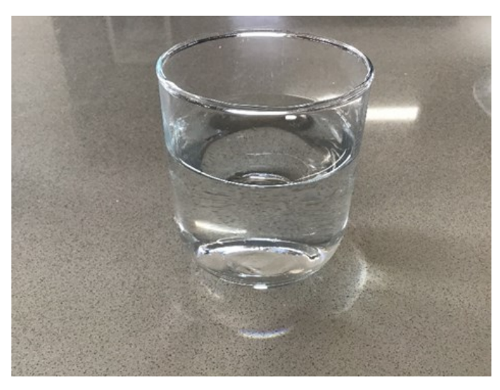
STEP 1: Fill your glass about 2/3 of the way with water.