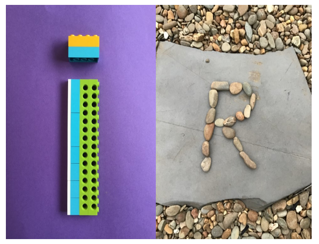
STEP 4: Or make your own letters from objects.