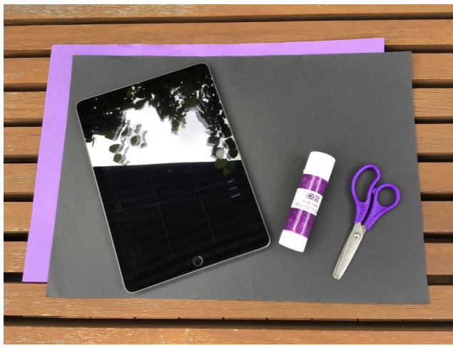
YOU WILL NEED: Device with camera (or digital camera), printer, coloured paper, scissors, glue.

Take a closer look around your house, garden and neighbourhood. Find objects that resemble letters. Take a photo and then turn your alphabet photography into a meaningful quote.