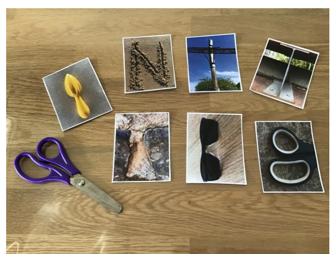
STEP 5: Review what you have, then use letters to make words that have meaning for you. Print, cut and glue onto coloured paper.