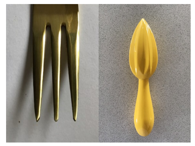
STEP 1: Search your home.